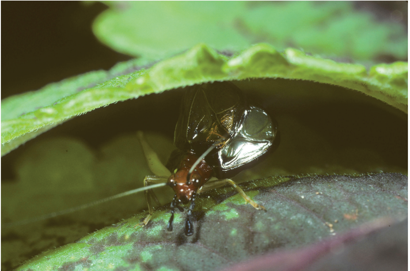
Fig. 3. Male singing from between leaves.

gave very even dispersal over the entire filter. Ten fields (area = 1.072 mm 2 ) at 160× were counted when total numbers were low (generally under 60/field). When densities were higher, 10 fields (area = 0.610 mm 2 ) were photographed using Kodak TMax 400 film. Negatives were then placed in a photographic enlarger and projected onto an 8-1/2 × 11 inch sheet of white paper where accurate counts could be made by checking off each sperm nucleus as it was counted.