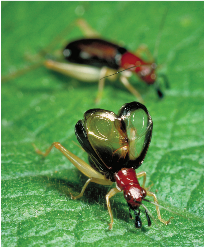
Fig. 4. Male singing and female approaching from behind.