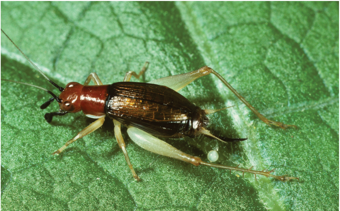
Fig. 8. Female with attached macrospermatophore.