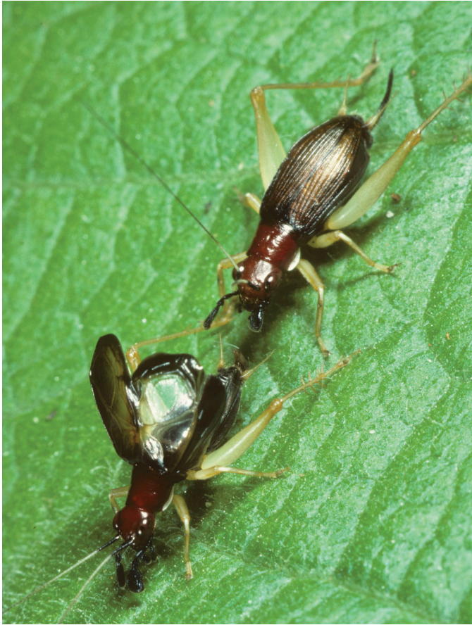
Fig. 7. Male singing with attentive female moments before the male backed under her and transferred a microspermatophore.

Females removed the microspermatophore, usually within seconds of its transfer, always within three minutes. Phyllopalpus females were apparently unable to reach the spermatophore directly with their mouthparts the way some other crickets (such as the oecanthines) do. Instead, they used the hind tibial spurs to "pluck" it out. This was accomplished by cradling the exposed portion of the spermatophore tube in the V-shaped notch formed by the two apical spurs of the hind tibia and subsequent rearward movement of that leg. This notch was run along the sperm tube until the bulbous ampulla portion of the spermatophore was reached. The ampulla then became lodged in the notch and the spermatophore was plucked out, after which the female removed it from her tibia with her mouthparts and ate it. The microspermatophore was usually completely consumed within two minutes.