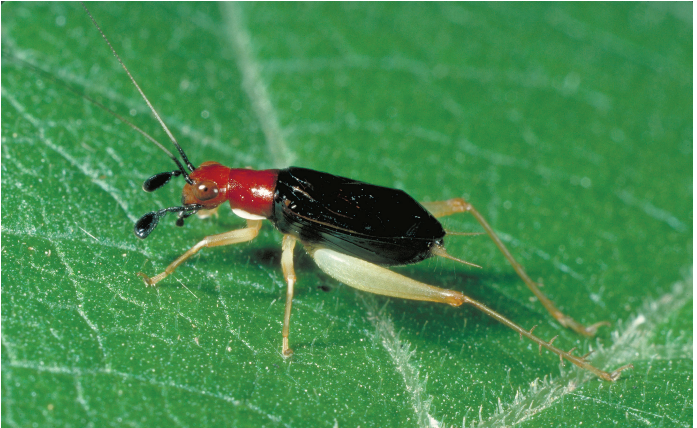
Fig. 1. Male Phyllopalpus pulchellus .