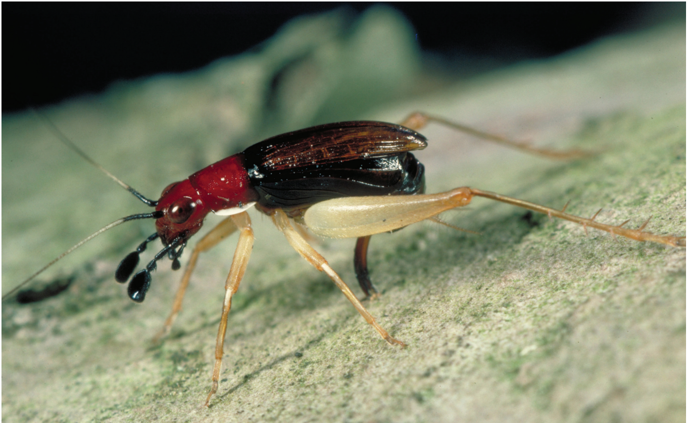
Fig. 2. Female ovipositing in trunk of an apple tree.