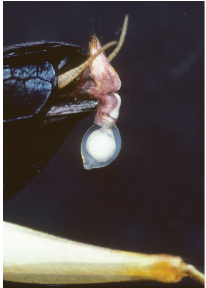
Fig. 5. Extruded macrospematophore in male's genitalia.