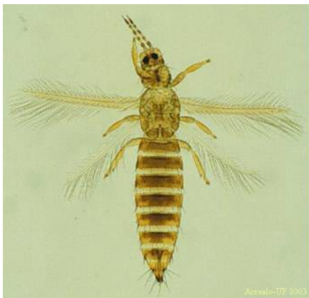
Fig. 1. Flower thrips, Frankliniella bispinosa , a major pest of southern highbush blueberries.

Flower thrips is an important pest of southern highbush blueberries (Fig. 1). They damage floral tissues including the gynoecium and pollen, which ultimately can affect yield (Liburd and Arévalo, 2005). Characterizations of thrips species in selected crops, including citrus, tomatoes, and peppers, have been conducted and information on phenology, damage and species complex for those crops is available. In southern highbush blueberries, information on thrips species complex and phenology is recent and fairly limited.