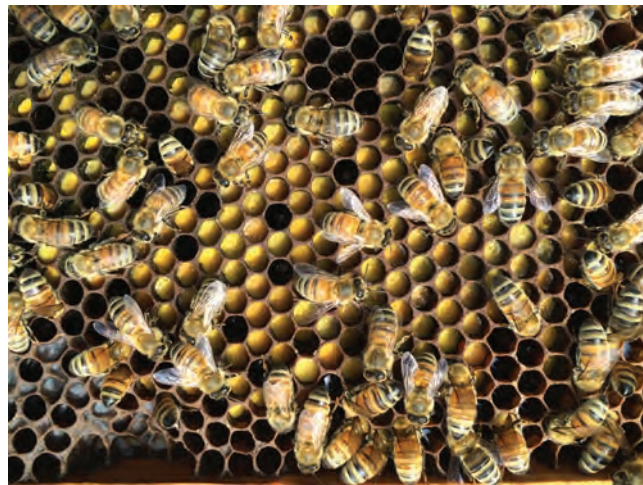
(l) Figure 3. A comb containing young brood. You can see eggs and young larvae developing in the cells. New colonies are full of developing immature bees. (r) Figure 4. Pollen stored as bee bread. Bees keep bee bread near the brood chamber since they mix it into the food they feed their developing larvae.