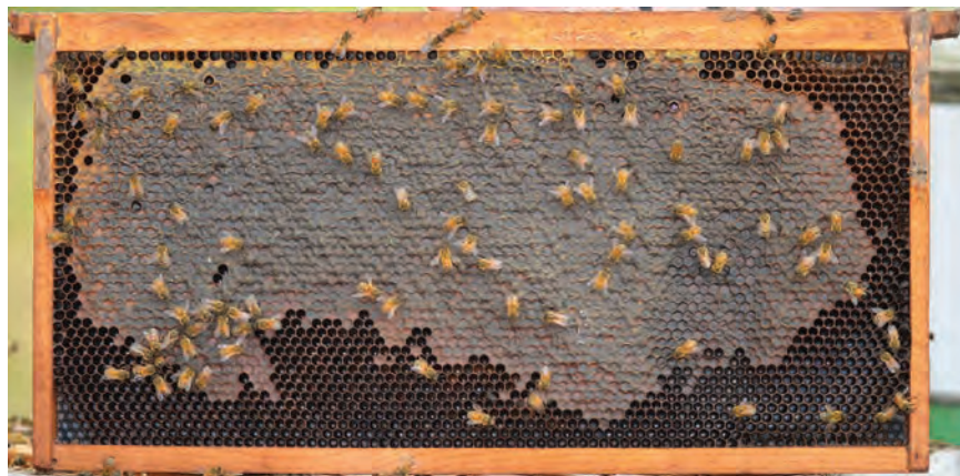
Figure 10. A frame of stored honey. Bees typically fill the perimeter combs with stored honey as winter approaches. The honey is a good insulator against the cold, but also serves as a source of fuel for the bees trying to heat the colony.

Fortunately, most pest and pathogen populations also decrease substantially during winter. The typical colony only has two main winter pests/pathogens to fear. They include the two Nosema species ( N. apis and, most notably, N. ceranae ) and tracheal mites. The Nosema species are single cell microsporidia (fungi) that infect bee guts. These spores compete against the bees for