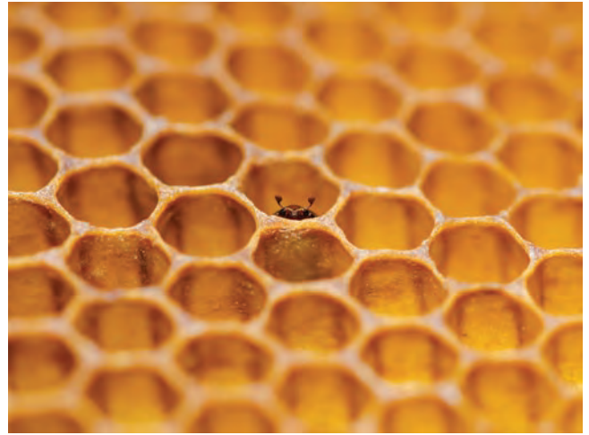
(l) Figure 8. A Varroa mite. This is one of the main killers of honey bee colonies around the globe. (r) Figure 9. A small hive beetle peaking its head out of the end of an open cell.

In the best case scenario, colonies in summer have reasonable access to a few, moderate quality nectar and pollen flows, mild temperatures, adequate quality water, low pest and pathogen pressures, and good food stores. If these criteria are met, the colony has a good chance at surviving winter. Otherwise, the colony's chances of survival are significantly lower.