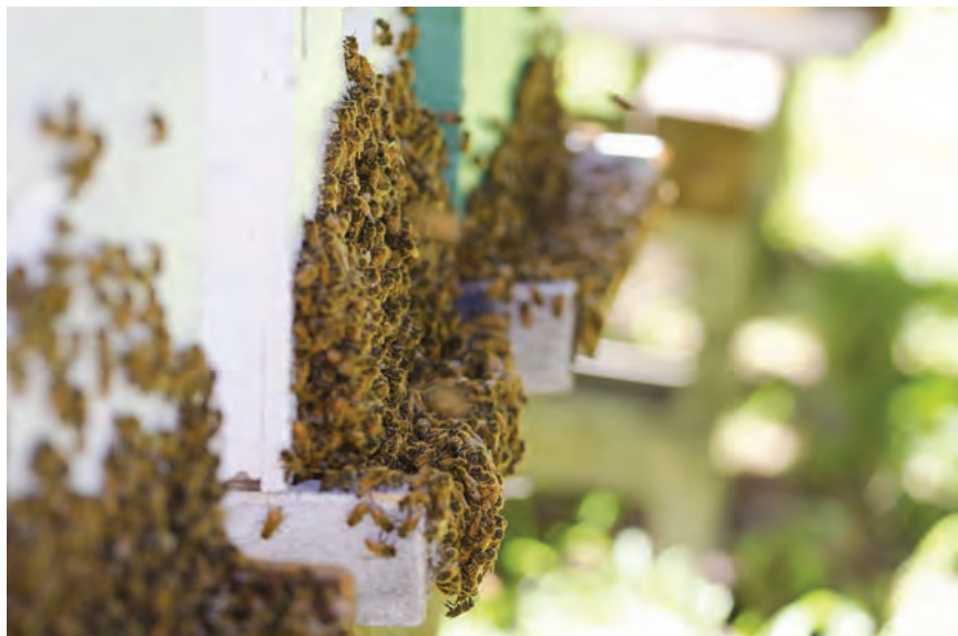
Figure 7. Colonies with bee beards. Many bees in these colonies left the colonies during warm temperatures in an effort to avoid overheating the nest.

Bees spend quite a bit of summer keeping the colony cool or foraging for any available nectar/pollen. Toward late summer (closer to week 20), colonies have another growing problem. Throughout summer, the adult bee and brood population in the nest has been on a steady decline. In contrast, their pest and pathogen populations have been rising steadily. It usually is mid-to-late summer when the “balance of power” between adult honey bees and their pests/pathogens makes an unfavorable change.