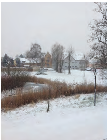
Figure 11. A cold winter. Bee colonies should enter winter with all that they need to survive. By this point, there is little a beekeeper can do to help the bees.

Unfortunately, tracheal mites and Nosema can produce similar symptoms in a sick colony in late winter so it can be hard to know with certainty which is causing the problem in the colony. A sick colony may have disorganized clusters of bees. It may die in early spring. You may see bees crawling on the ground around the colony entrance. You also may see bees exhibiting K-wing which is a symptom where the front and hind wings of a bee become unhinged