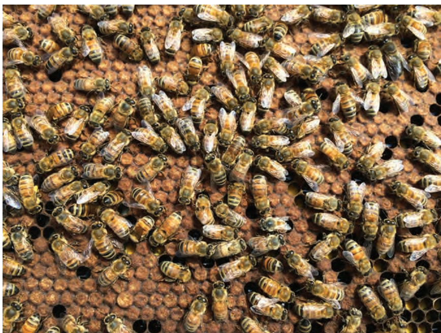
Figure 6. Capped brood under the watchful eyes of healthy adult bees. Maturing colonies in spring and summer contain lots of capped brood.

Toward the end of the main nectar flow, many of the adult bees that composed the original swarm have died and have been replaced with adult bees born at the new nest site. These bees now represent the correct ages and typical demographics of a colony, unlike the swarm that founded it which was composed of mainly older bees. Further-