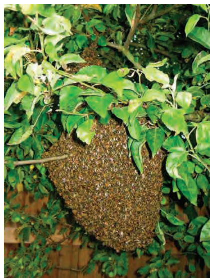
Figure 1. A honey bee swarm. Swarms are baby honey bee colonies.