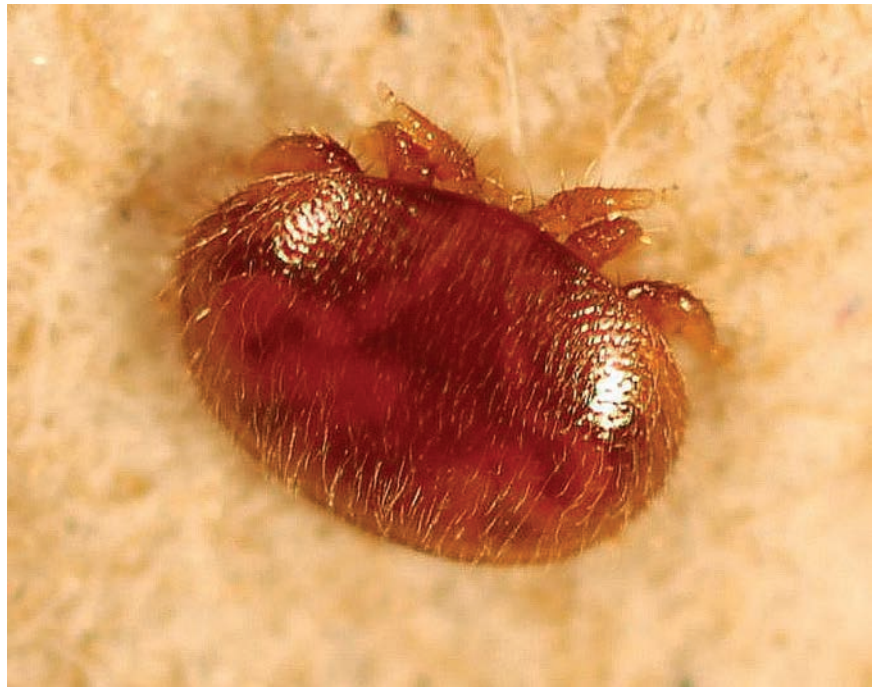
Figure 1. An adult female Varroa .

The excessive colony losses that have dominated our discussions the last decade have given rise to meetings galore, to “save the bees” groups left and right, to initiatives, congressional hearings, and to increased funding for bee research and education, all among other things. One of the groups born from the bee loss chaos was the Honey Bee Health Coalition (HBHC, http://honey-beehealthcoalition.org/ ). This group has published fantastic information on controlling Varroa ( http://honeybeehealthcoalition.org/varroa/ ). I think the pdf entitled