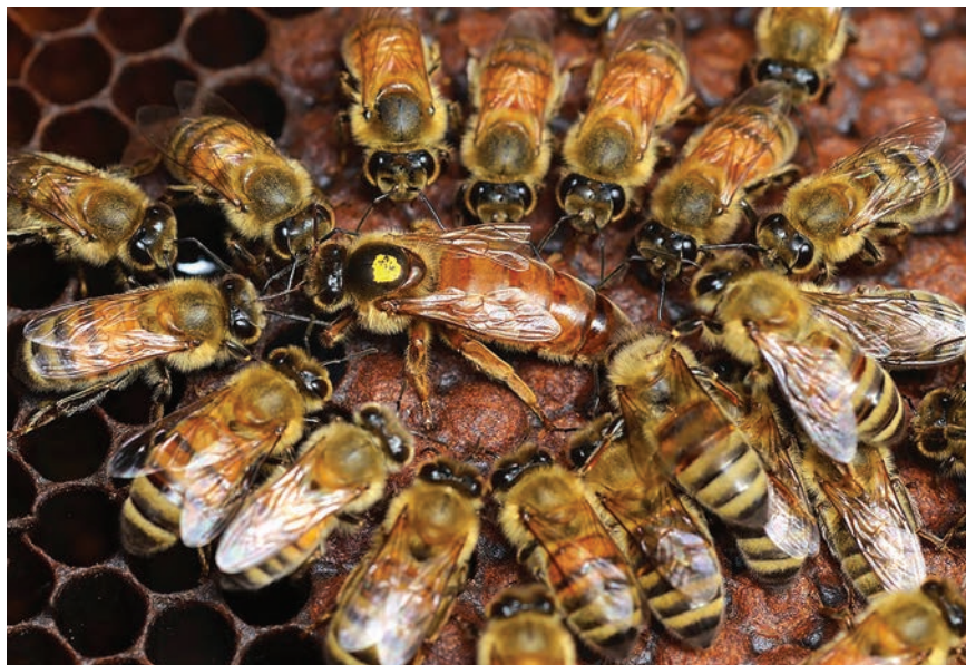
Figure 5. A queen surrounded by her retinue of workers.

D – Purchase and use queens from reputable breeders. Ask other beekeepers who they would recommend or try a few queens from different sources and decide for yourself.