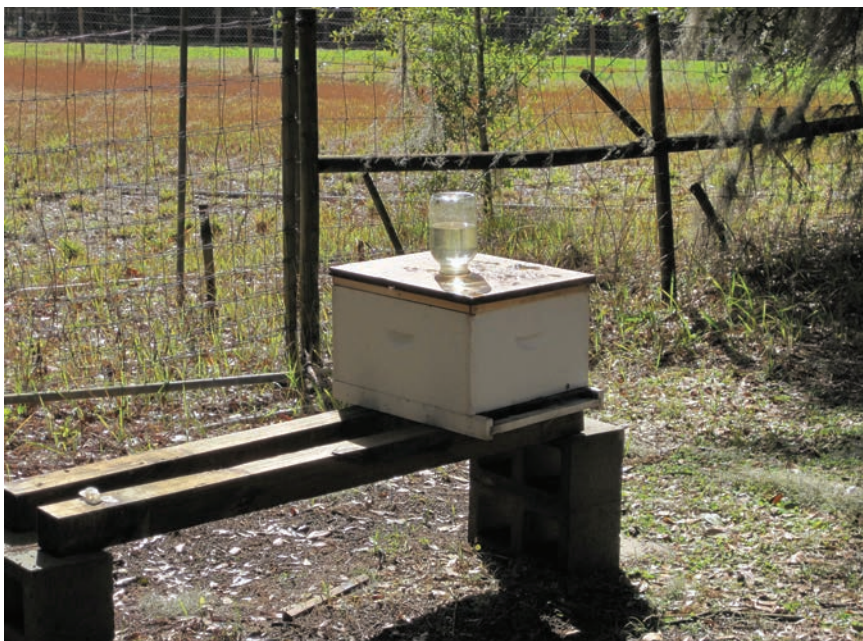
Figure 4. A colony fed sugar syrup via a jar feeder on top of the hive.

How do you know when your bees need food? The simplest way is to hoist your colony with one hand from the bottom box (Figure 3). I usually try to do this from behind the colony. Grasp the handle on the lowermost box and try to rock it forward, off its stand, with one hand. Colonies that need honey are easy to rock forward, thus signaling that they need to be fed. Colonies that are hard to lift with one hand generally have enough honey, with no further action required.