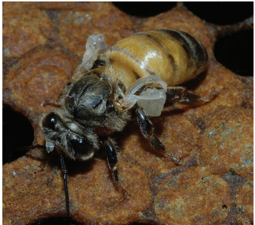
Figure 2. An adult bee infected with Deformed Wing Virus.

video entitled Will Varroa kill my bees? ). Consequently, you must monitor for Varroa in your colonies. One of the great things about the HBHC Varroa management guide is that it includes a table (reproduced in this article as Table 1, with all credit going to the HBHC for its development) that notes the Varroa populations that are damaging to your colonies (the “thresholds”). In the table, the HBHC tells you what percent mite infestation (i.e. number of Varroa per