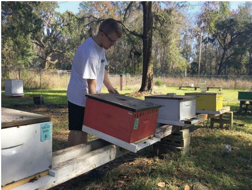
Figure 3. Hoisting a colony from behind to determine how much food it has.

be able to recognize when their colonies need food and how to feed them.