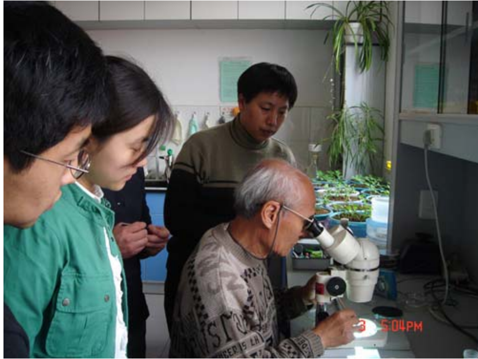
A class in laboratory