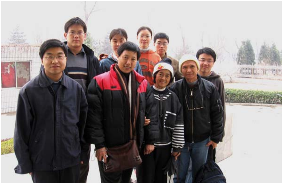
In a field trip.