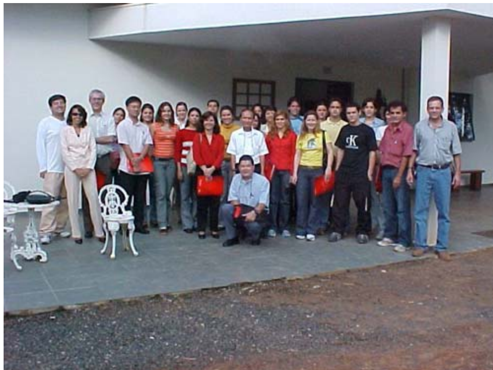
A group of participants