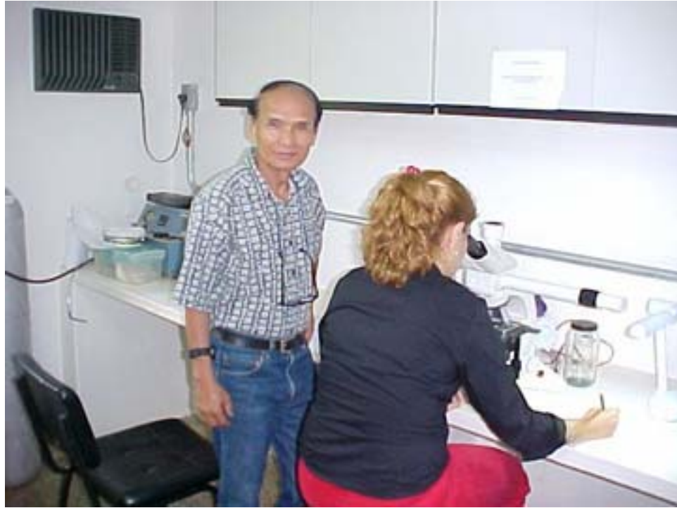
A scientist in a practical class

June 2005, one student from Brazil came to the Department of Entomology and Nematology to work with Entomopathogenic nematodes for 6 months.